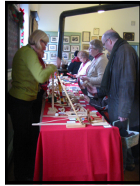
Sales were brisk

On Open Sunday visitors were treated to the sights and scents of the season. The schoolroom was draped with fragrant boughs of cedar and pine. A large fir tree was decorated with an assortment of Victorian style ornaments. Opportunities to make an ornament and to try some of the schoolroom games were provided. At both events, everyone enjoyed the Christmas cheer with tea, cider and cookies.